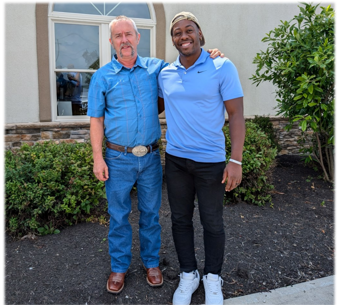
Our hardworking volunteer landscapers