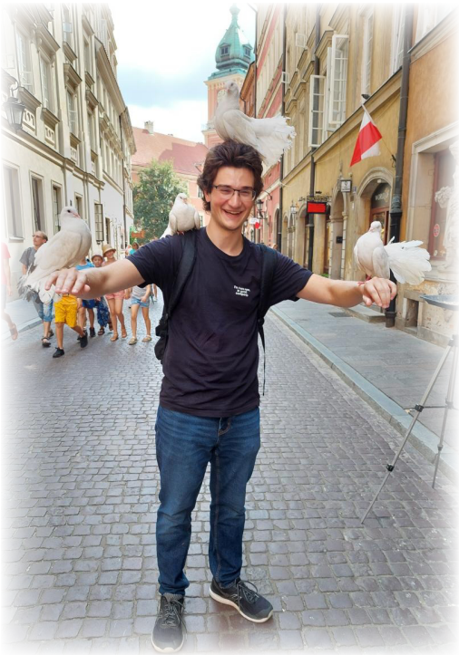
"This is a fun picture from Warsaw during my trip to Europe earlier this year. A guy was letting people hold trained doves for $5, so I did."