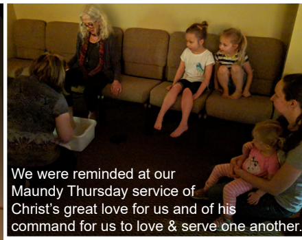
We were reminded at our Mauddy Thursday service of Christ's great love for us and of his command for us to love & serve one another.