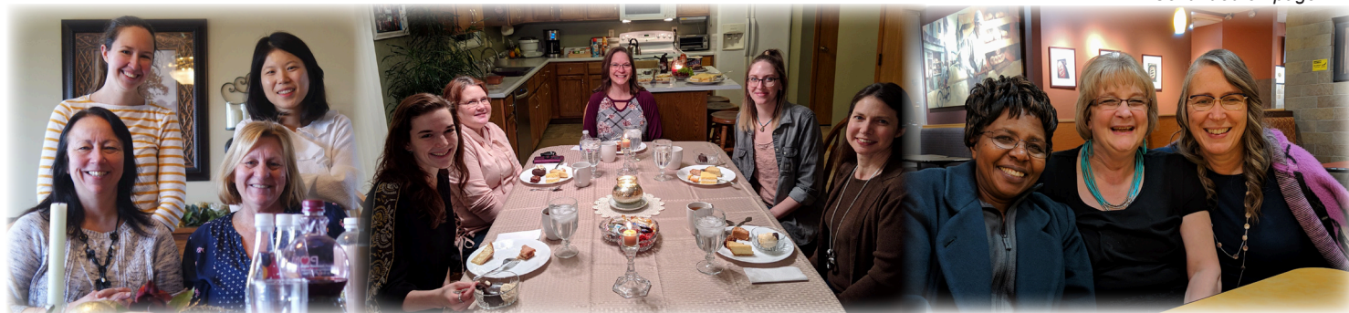
Pictured above are ladies participating in various recent LIFE groups. The L-ove, I-nspiration, F-ellowship and E-ncouragement often take place around great food. You never know what you will learn! The three ladies pictured on the far right discovered that they were all born the same year.