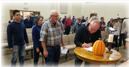
The Meeting that Worked!...continued