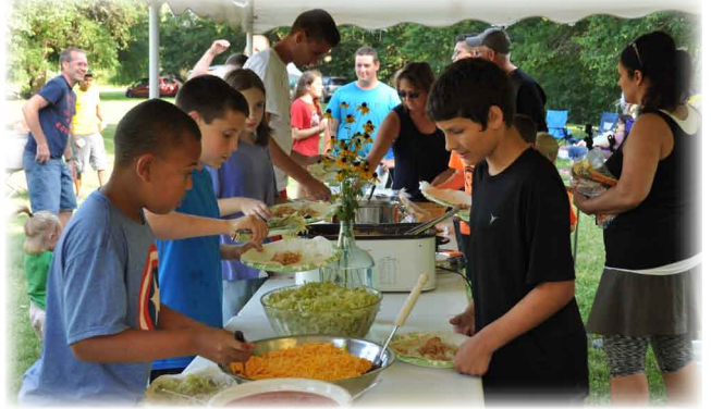
You can see more pictures from the Camp-Out on LCF's Facebook page.