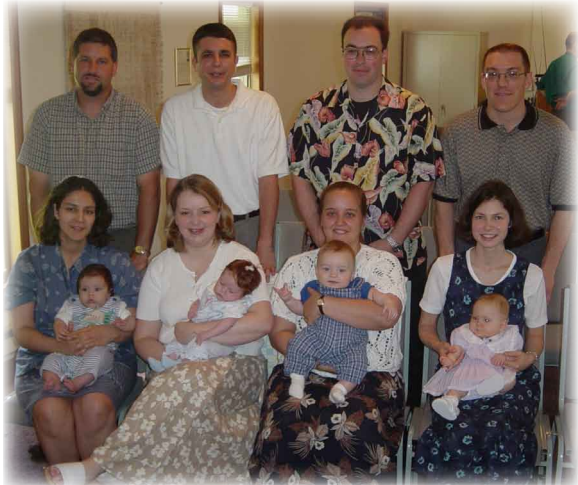
Oh, the difference 12 years makes! ☺