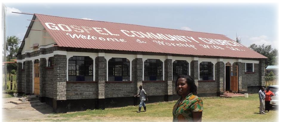
Opportunities for ministry abound at this church in Nakuru.

Our discussion on women in the church was lively and precipitated by Rob's plan to preach on I Timothy 2: 11-15. He invited our input. We come from different backgrounds but found a lot of common ground. Things we want to see: an approach that looks to Scripture for light and healing; an environment at LCF which nurtures women and makes room for all their gifts (we agreed that we can do more in this area, for sure); an atmosphere conducive to searching God's Word together, with open minds and hearts. We were largely of one mind with Rob's thoughts on the passage.