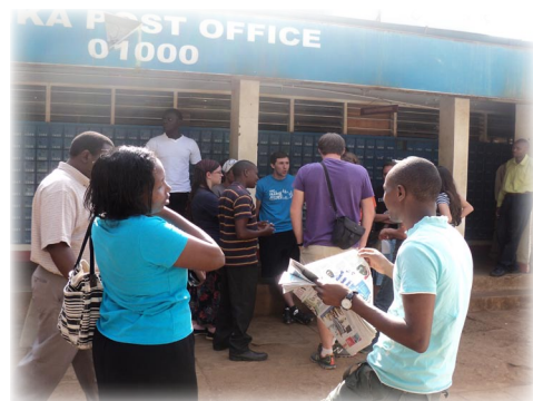
Visiting at the city of Thika.

London Christian Fellowship seeks to develop authentic and passionate followers of Jesus Christ.